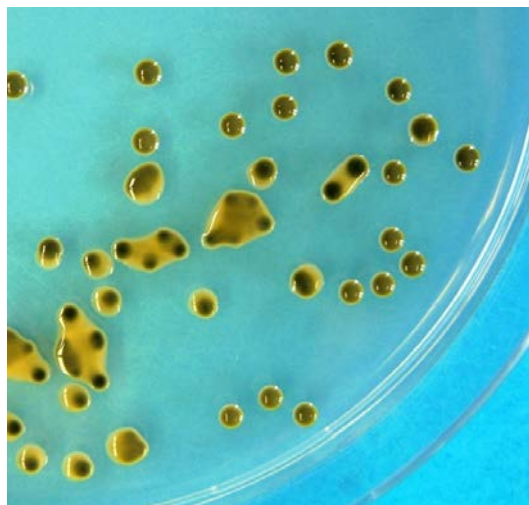
Figure 4. Cmm morphology after 10 days of incubation on SCMF