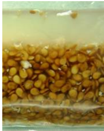
Figure 1. The seed extraction buffer and seeds after stomaching